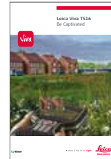
Leica Viva TS16