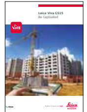
Leica Viva GS15