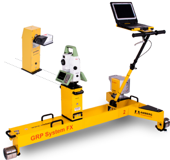
Front: Amberg IMS 1000 with tachymeter Back: Profiler 120 FX for Amberg IMS 3000