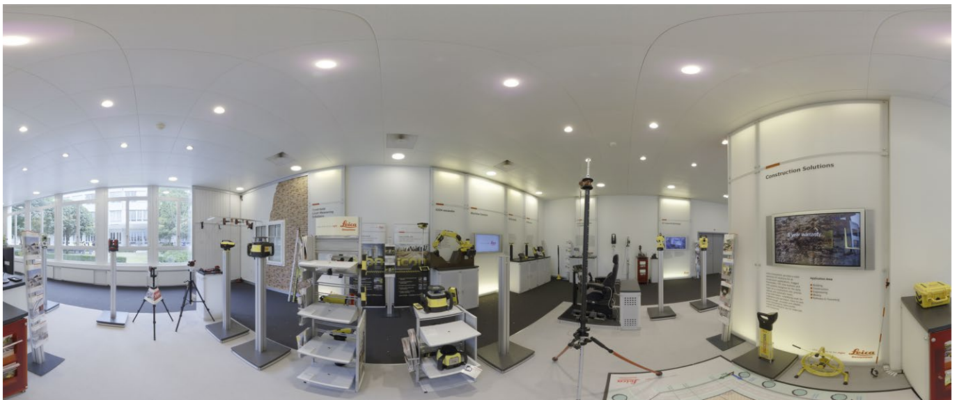
Figure 1: RTC360 panorama of the Leica Geosystems showroom, in Heerbrugg, Switzerland.

The Leica RTC360 3D laser scanner collects 432 Megapixels (MP) of HDR images. These source images are designed with considerable overlap to ensure good blending performance. The source images have a native resolution designed to match the highest scan setting at 3 mm @ 10 metres. When considered as a panorama, this is equivalent to a 200 MP panorama, that is, 20480 x 10240 pixels, or equivalently a 5120 (5k) cube map. Leica Cyclone REGISTER 360 and Cyclone REGISTER both can be configured to deliver this resolution.