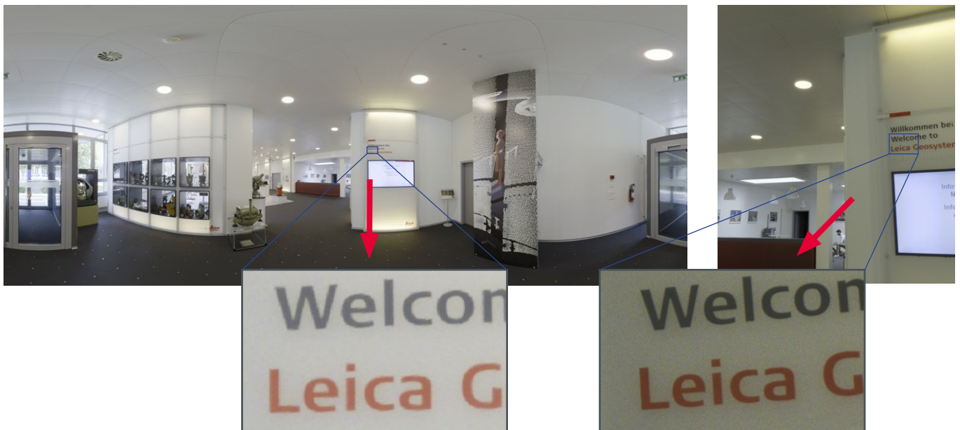
Figure 3: Comparison of 200 MP panorama resolution, on the left, versus source image resolution, on the right. Source image is in D65, panorama is default illuminant compensated.

resulting pixel size on the order of 300 uR. Panoramic images at 200 MP have a matched inherent pixel size, at 2\pi / (20480) = 306.8 uR.